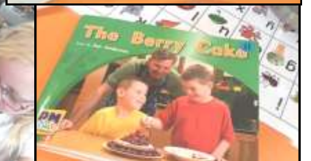
Berry cake fun for the Aliens reading group.