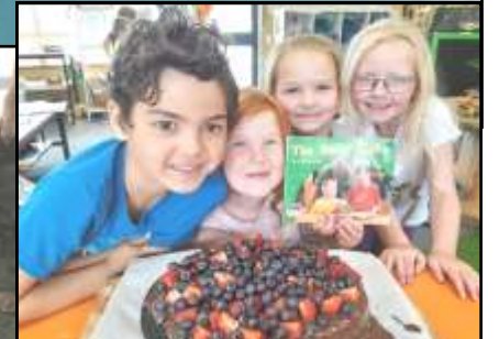
Pod 2 have been enjoying Home Learning this term and have shared posters, art, facts and recipes that they created at home.