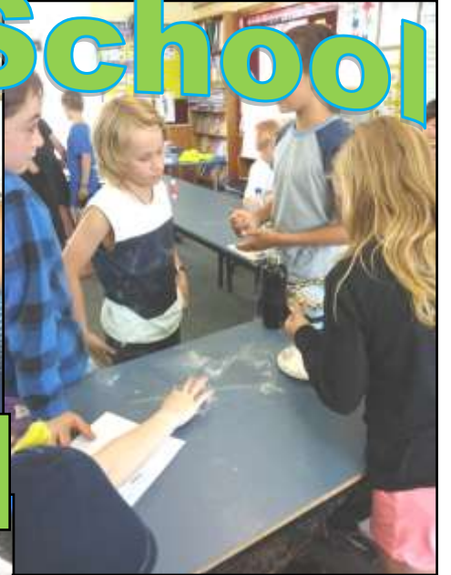
Science Activities in Room 4